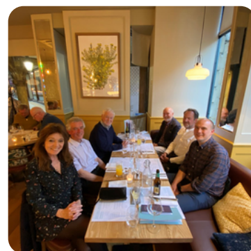
ON Dinner in Newcastle