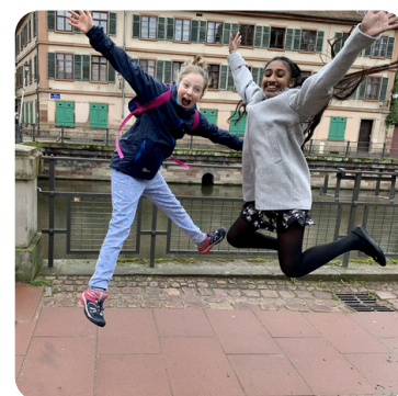
Y7 MFL Trip