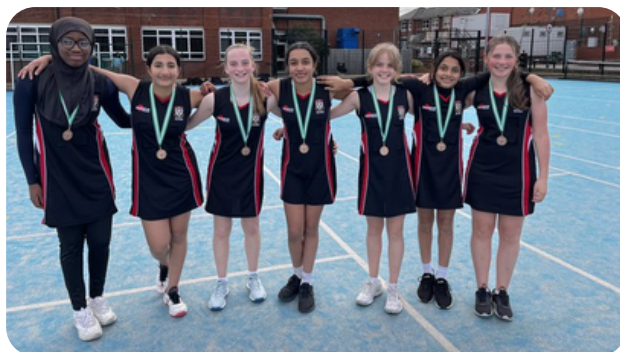
U13 Girls came 3rd at the county netball tournament