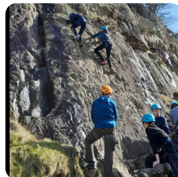
Y8 Patterdale Trip