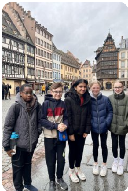
Y7 MFL Trip