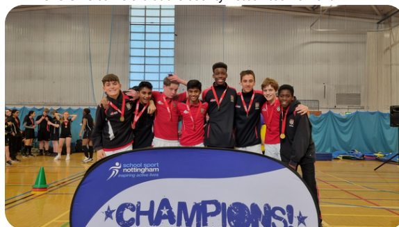
Our Y8s becoming the County Athletics Champions