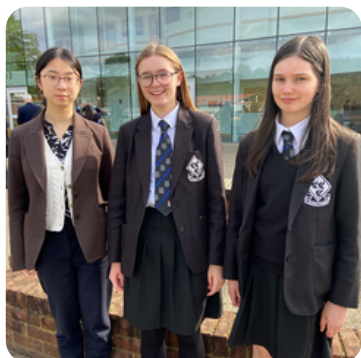
ECF National Chess Team