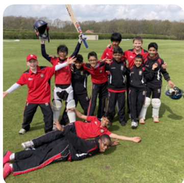
U12A first fixture of the cricket season