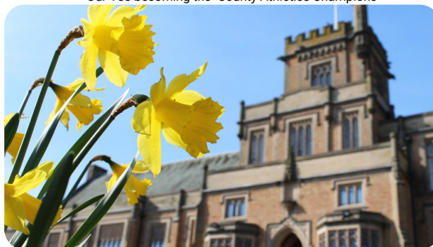
Spring has Sprung