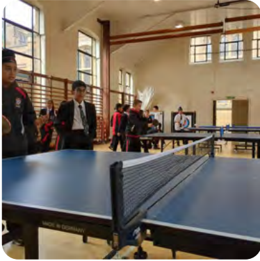
YEAR 7 HOUSE TABLE TENNIS