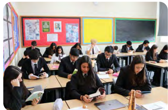
DEAR DAY 2023