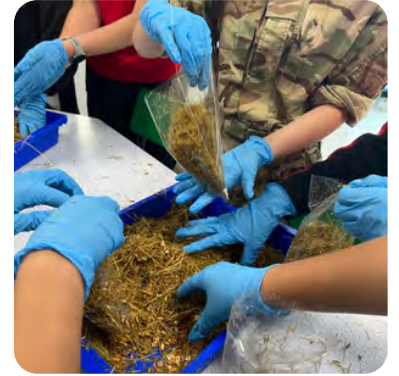
CULTURE CLUB LEARNING HOW TO CULTURE OYSTER MUSHROOMS