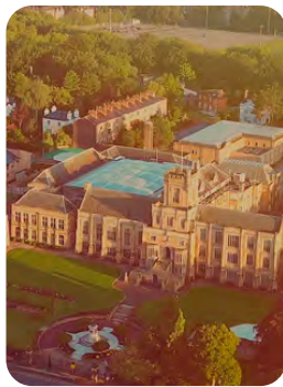
CLICK TO WATCH OUR DRONE VIDEO