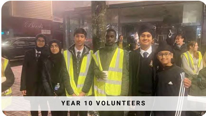
YEAR 10 VOLUNTEERS