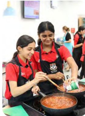
FOOD LESSON COOKING FOR THE GURU NANAK'S MISSION