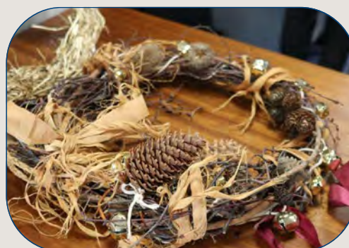
Wreath Making in Gardening Club