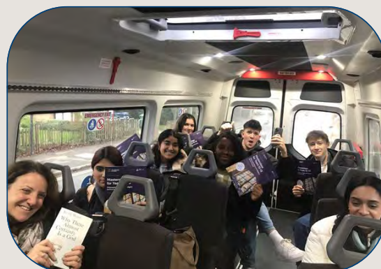
A Level Trip to the University of Oxford