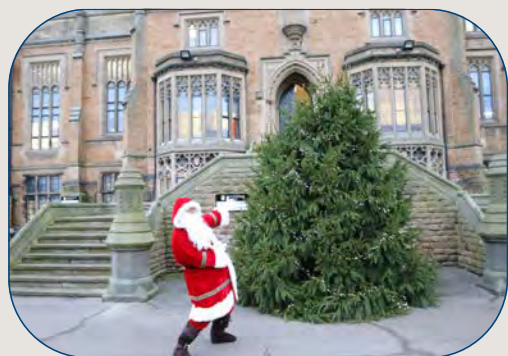
Santa at NHS