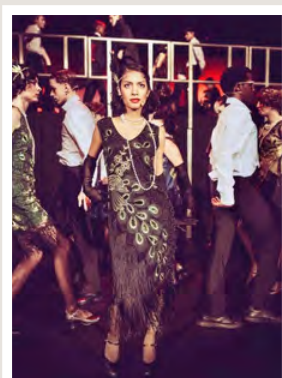
The fantastic cast of Chicago