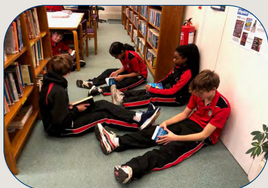
Year 9 Reading Club