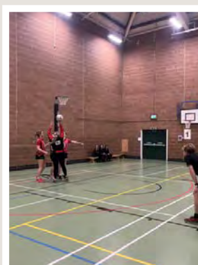
Staff vs Students netball