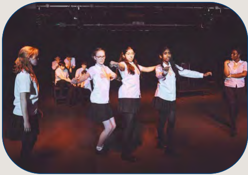
Year 12 production of 'She's bad news'