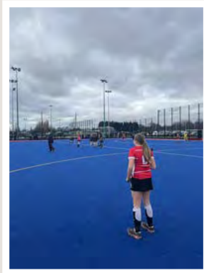
U16 National Tier 3 Hockey Finals