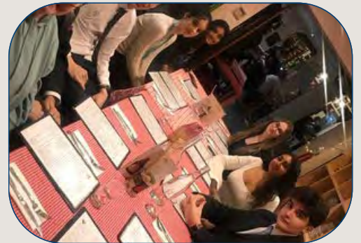
Pizza debrief after the opening ceremony to Cambridge MUN