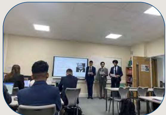
Y12 presentations on the different aspects of Detente