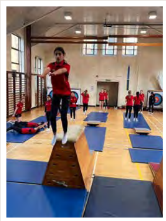
Y8 Gymnastics lesson