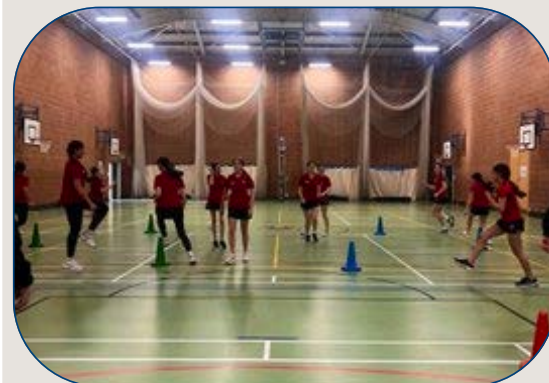
Last training session before Netball season ends for Y9&10 girls