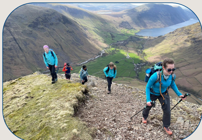
Scouts camp in Ennerdale