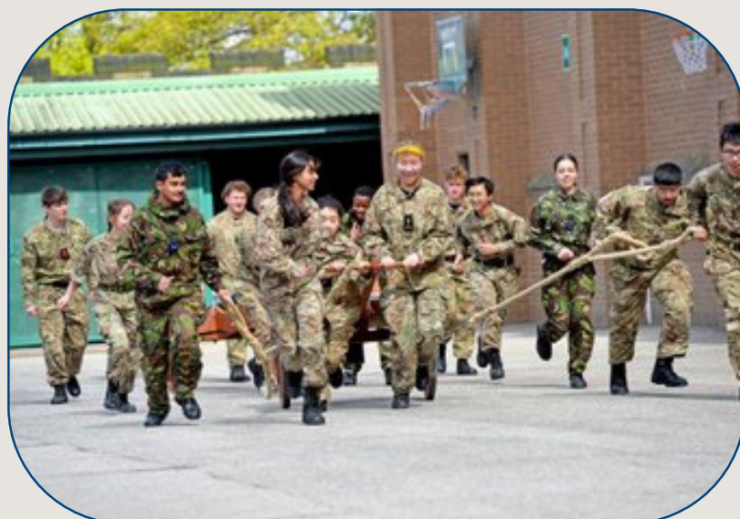
CCF Inspection Day