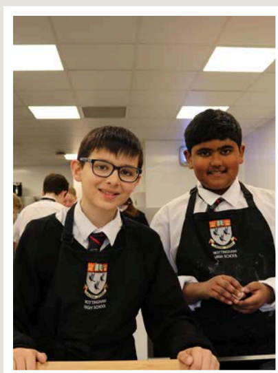
Y7 Food club celebrate Eid