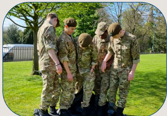
Command Tasks at the CCF Inspection Day