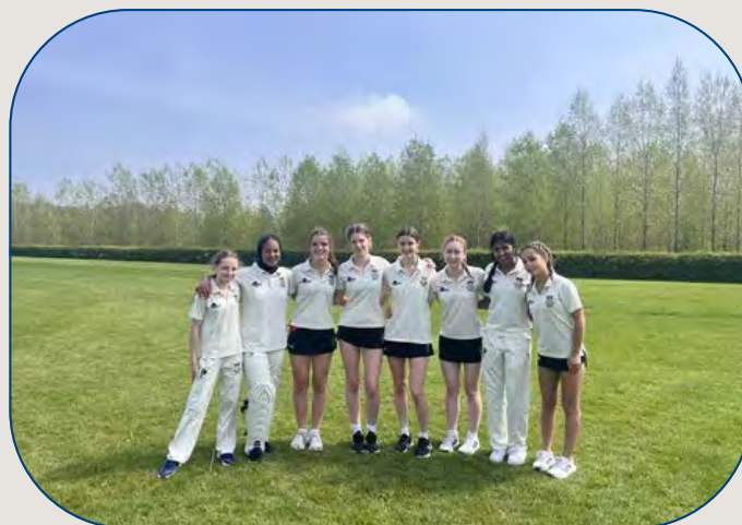
The Under 15A's Hardball team got their first win of the season against Ratcliffe College