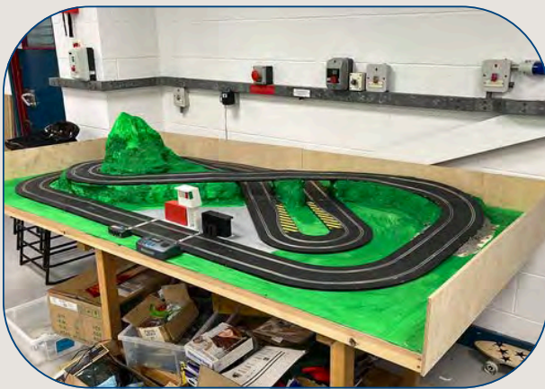
The Scalextrics teams are just about ready for the nationals in June.