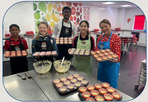
Charity cup cakes in Food for the Rosie May Foundation