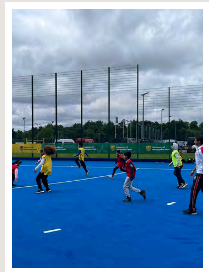
Year 7 Taster Day