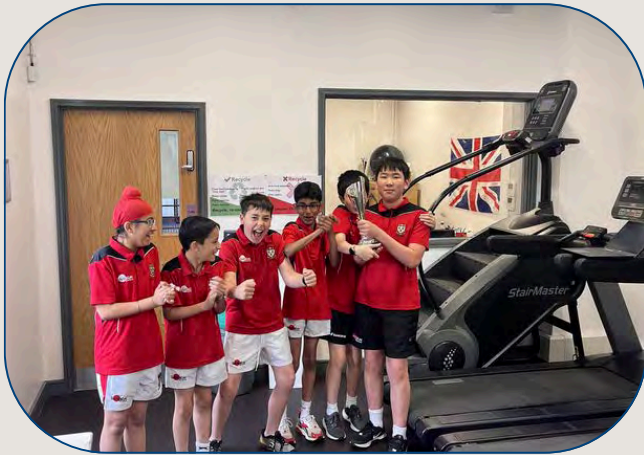
Year 7 gym challenge completed!