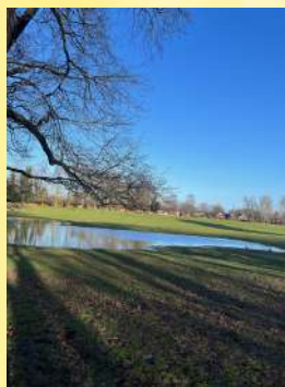
Rupert W-R. (RA)