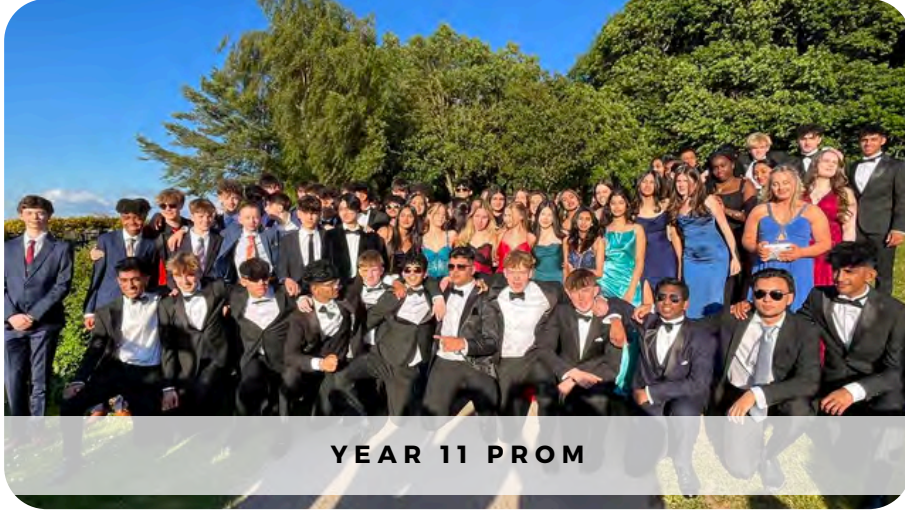
YEAR 11 PROM